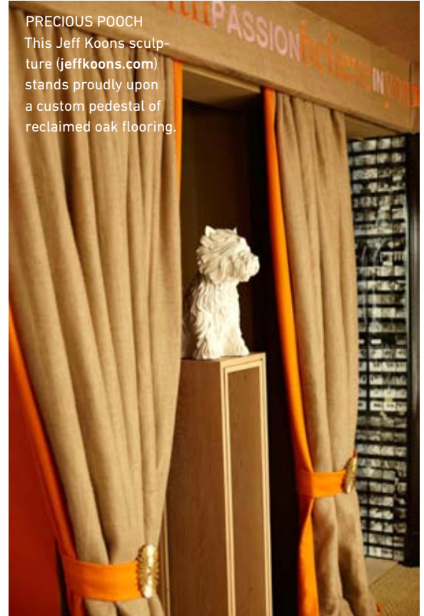
PRECIOUS POOCH This Jeff Koons sculpture ( jeffkoons.com ) stands proudly upon a custom pedestal of reclaimed oak flooring.