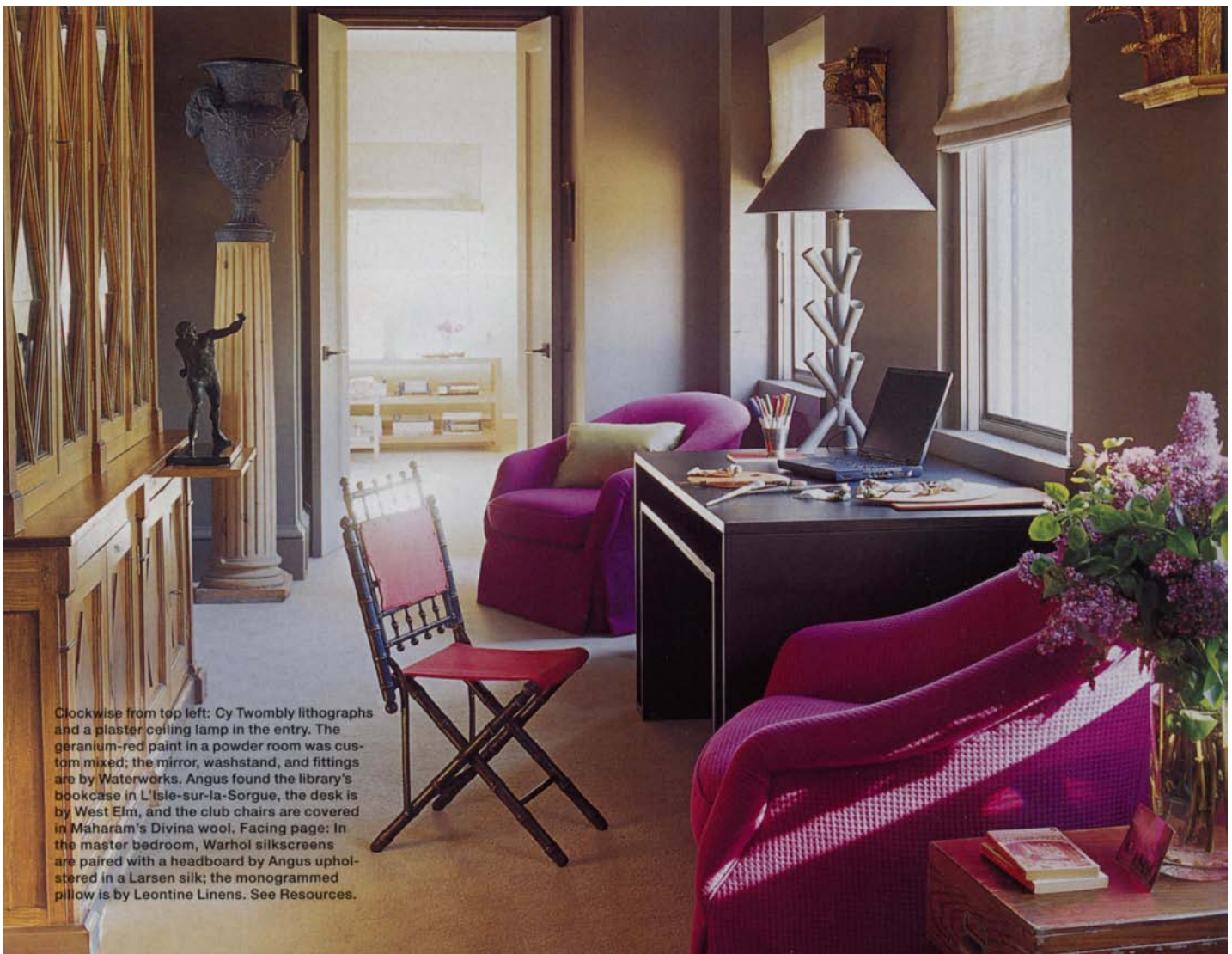
Clockwise from top left: Cy Twombly lithographs and a plaster ceiling lamp in the entry. The geranium-red paint in a powder room was custom mixed; the mirror, washstand, and fittings are by Waterworks. Angus found the library's bookcase in L'Isle-sur-la-Sorgue, the desk is by West Elm, and the club chairs are covered in Maharam's Divina wool. Facing page: In the master bedroom, Warhol silkscreens are paired with a headboard by Angus upholstered in a Larsen silk; the monogrammed pillow is by Leontine Linens. See Resources.